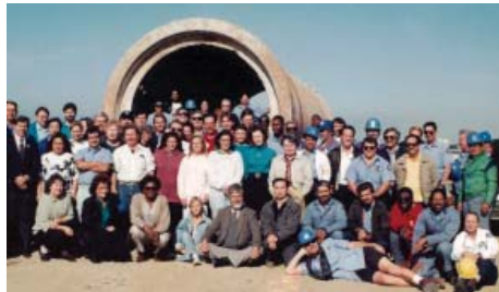
This is a section of the outfall pipe.

It's now time for the treated wastewater to pass through one additional set of screens and to then enter the outfall structure. The outfall pipe extends 4 ½ miles out to sea and ends in a y-shape diffuser in water 320 feet deep.