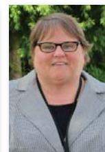
Jennifer Geran Library