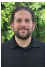
Brian Anthony Park & Recreation