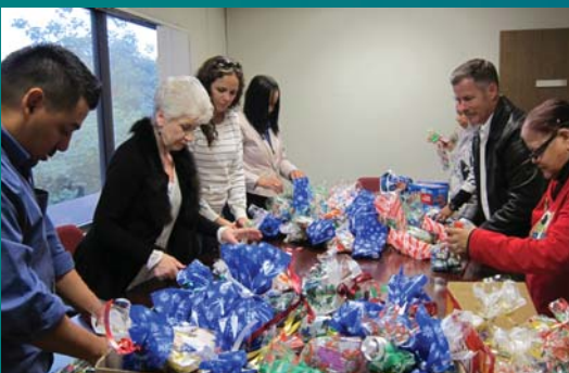
Boardmembers on the Membership Committee stayed late to make goody bags for those members who attended the Holiday Party.