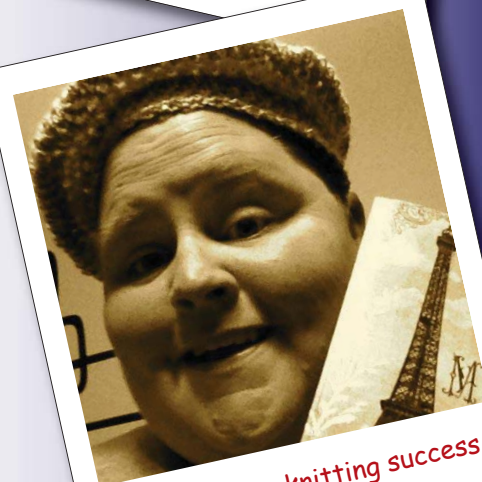
Selfie of my knitting success