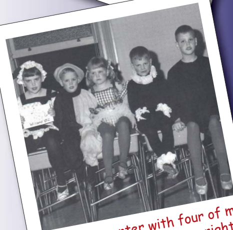
Me, age 4, center with four of my siblings, my twin is to my right