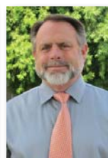
Roy Wurth Transportation & Stormwater