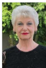
Kathryn Campbell Library